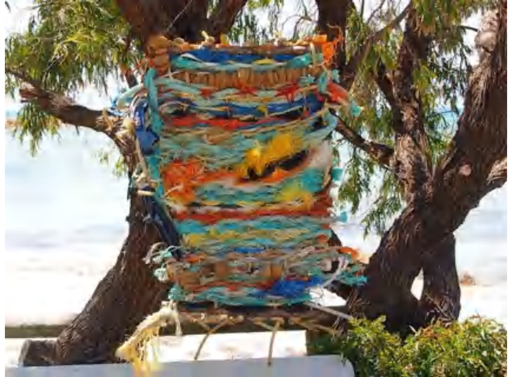
Artwork and picture by Jodie Cooper